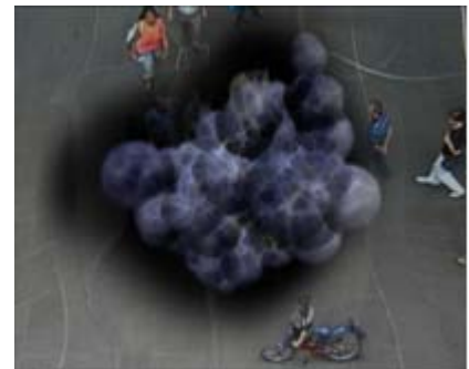
Fig.3. “Hidden Topology of Being”, still from the 3 video-animation.

One day, maybe, our brain will be able to perceive how we exist in the multidimensional universe or even multiverse. For the time being, we have only our imagination in command and an enormous diversity of protein globules, each of them suggesting, in a different scale, a blister of some world. {fig.3}