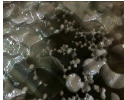
Fig.5. "Molecule", still from the 3D video-animation.

If we assume that the essence of life is a piece of information, encoded in a sequence of letters, then this sequence has to assume a proper spatial form to become a message. The information transfer from 22 thousand human genes to 400 thousand highly differentiated human proteins (responsible for most biological processes ranging from shaping an eyeball to determining the way we move) is strongly correlated with energy issues and depends on interactions of the whole molecular network within a cell. This process is depicted in the central dogma of molecular biology and reveals the crucial role of RNA or rather the multitude of types of RNA molecules in it. Recent studies have been looking at this biomolecule through a new light based on our knowledge concerning both life processes and their origin. RNA can assume a form of a double helix like DNA or a folded thread like a protein; it can be both a replicator and an enzyme. It has become the best candidate for the "seed of life". Still, we can only speculate on the environmental conditions of molecular synthesis 3.7 billion years ago. The truth may lie in all of today's hypotheses. Maybe, under some circumstances, a few cosmic amino-acids met an enclave of proto RNA networks breeding in a clay strata which led to the catalysis and replication of molecular sequences. Such a scenario would bring together many cross-cultural myths concerning our beginnings. {fig.5.}