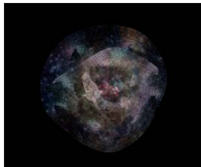
Fig.2. “Proteios”, still from the 3D video-animation.

Still, an amino acid sequence (the primary structure) says very little about the complexity of the unique topology of a folded protein. The amount of dimensions needed to describe its conformation (tertiary or quaternary structures) equals “3D n ” where “n” is the number of atoms. This is far beyond the capabilities of our minds to envision. I was already enchanted by the geometrical beauty of the secondary structure, with its folding alpha helixes, beta sheets and turns. They reminded me of the mysterious geometric formations named Calabi-Yau spaces in which, according to the superstring theory, successive dimensions of our world are “curled up” on the subatomic level. I found not only formal resemblances, but also similarities in their evolvment: from a point (an atom) into a linear narrative (a chain of amino acids) shaping bending and twisting surfaces into complicated spatial structures of interactions.